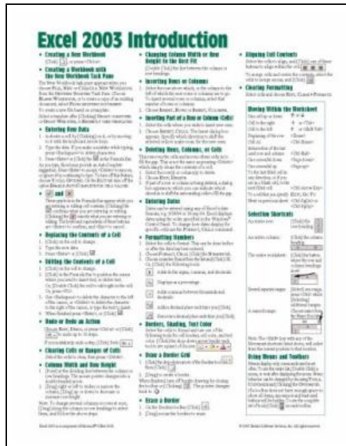
Filesize: 3.7 MB